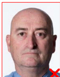
The face and background must be shadow-free