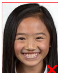
Smiling is not permitted – must be a neutral expression