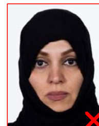
Head-coverings must not cover the face – same with hair