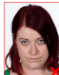
Head must not be tilted down or up