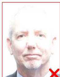
Incorrect image exposure– images cannot be too light or too dark