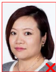
The subject must be facing forward, without any head angle